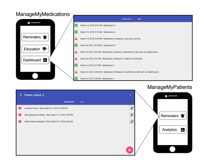
Figure 3. ManageMyMedications and ManageMyPatients: Modules that compose the applications, and screenshots of the module that allows a healthcare provider to add and modify reminders for a particular patient (ManageMyPatients) and of the dashboard module (ManageMyMedications). Other tabs allow real time access to the logged data (ManageMyPatients) and to see the reminders set by the healthcare team (ManageMyMedications).

It is easy to see how the aforementioned functionalities clearly match with some of the modules that characterize ManageMyCondition, and are described in Section III-B. In particular, the ManageMyAsthma application is composed of 4 modules: a) the Survey module, which is used to deliver the initial and final survey to the users, b) the Reminders