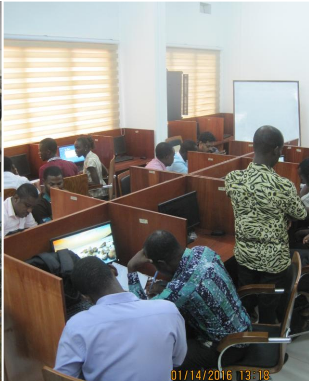
Team work on an assignment