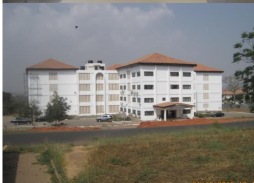
Engineering Sciences Building at UG