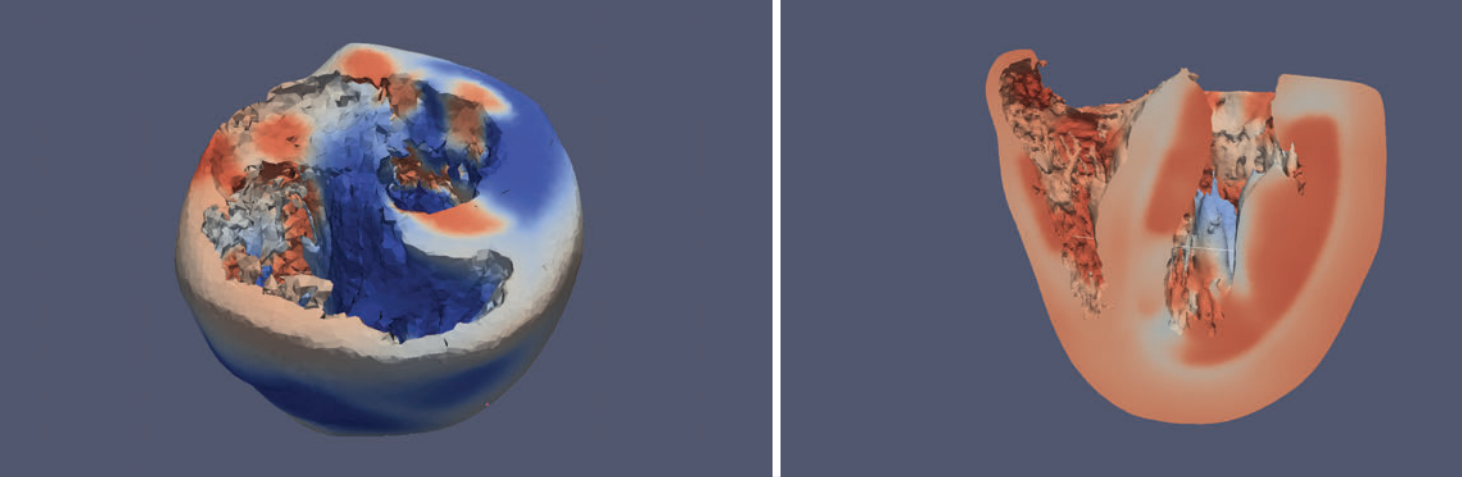
Computer models of the human heart will help us predict health risk and produce new medicines cheaper and faster.