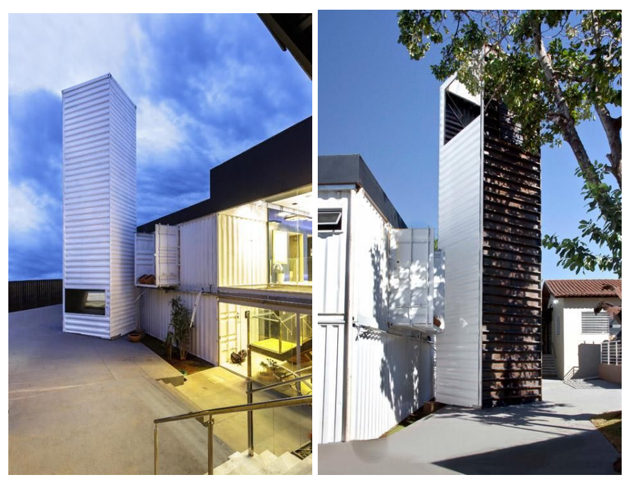
Figures 3 and 4: Representing a two mirror display system using large mirrors and a shipping crate as the holder. This system has been created in the past and Figures 3 and 4 above provide a good starting point for where we can take this design option in the future.

This system would encompass two flat mirrors that ultimately allow the view of the water to be displayed at ground level for an easy viewing experience.