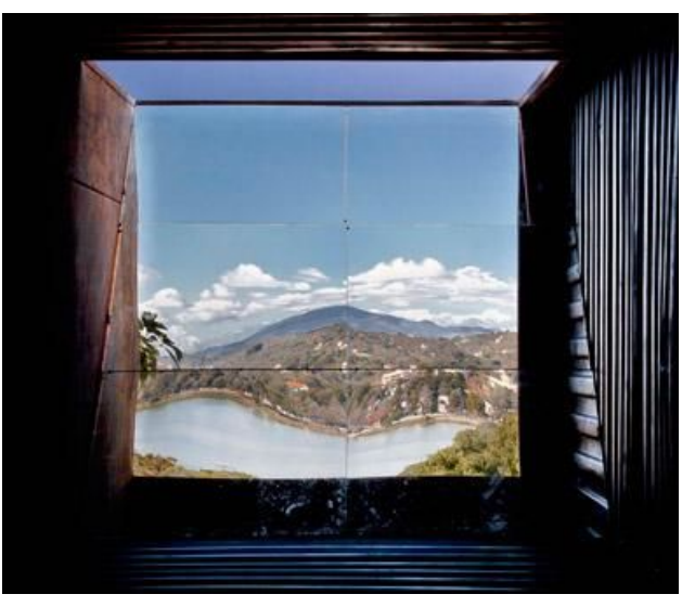
Figure 5: Showing how the image is displayed in the shipping crate container example of the two mirror system.